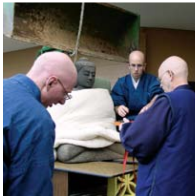
Replacing the altar cloths at Great Vow Zen Monastery.