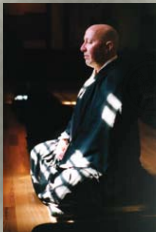
Doing zazen at Zen Mountain Monastery