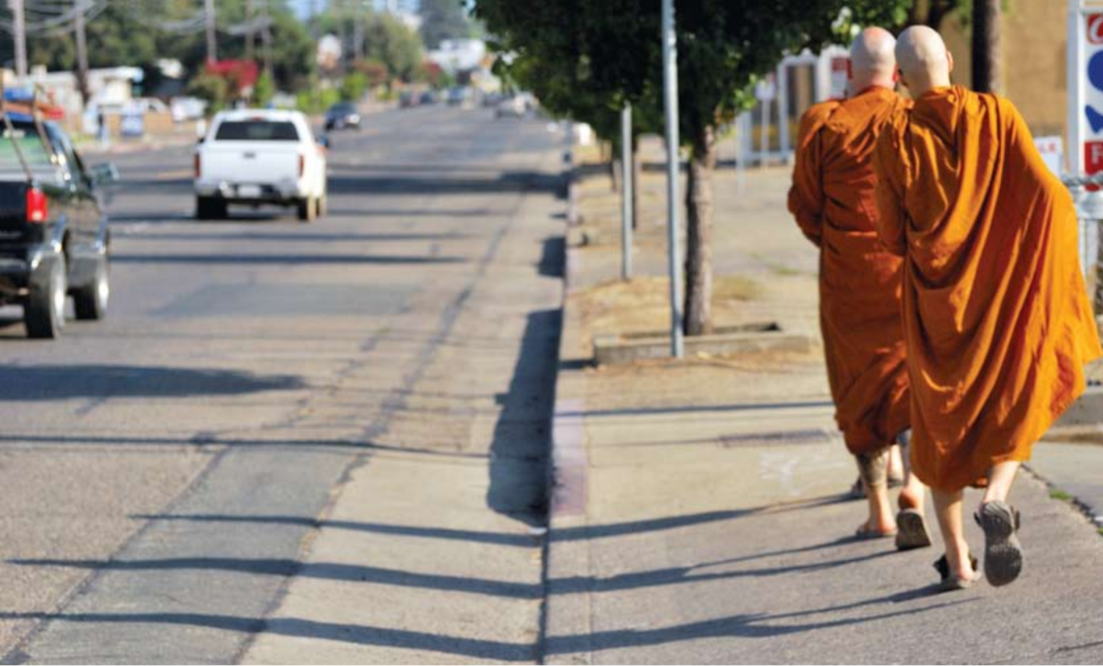
Monks from Abhayagiri Monastery going for alms in Ukiah, California.

call a Buddhist conscience for the world. In traditional monasticism, Buddhist monastics are supposed to remain detached from the world, even though they're interacting with laypeople to receive their alms and to preach the dhamma. But today's monastics are going to have to be much more aware of what is happening in the world. As the gap between rich and poor widens, monastics are going to have to present a Buddhist perspective on issues such as war, poverty, and ecological destruction, reminding us that the primary values in human life should be compassion, loving-kindness, justice, and equity.