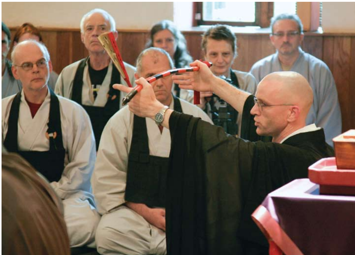
A Shuso Hossen ceremony at Zen Mountain Monastery in Mt. Tremper, New York.

teachings. They want to learn the dharma broadly, as well as in a way that applies to their own life.