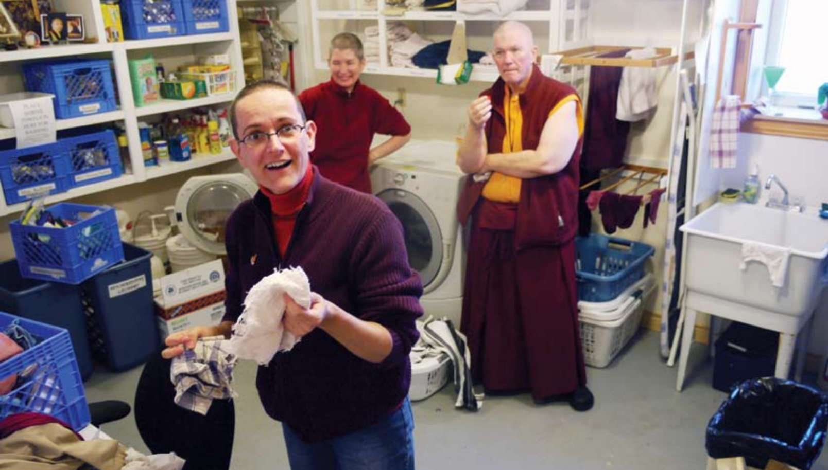
Monastic residents doing laundry at Gampo Abbey in Cape Breton, Nova Scotia.

around the world, the reincarnates are often not monks, which sometimes causes problems.