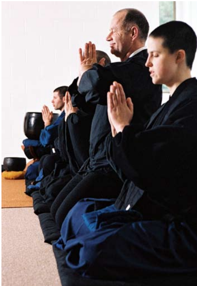
Morning service at Great Vow Monastery in Clatskanie, Oregon.

The idea that we don't really need monasticism here is very wrong. The source of it is an unwitting Protestant ethic that is unwilling to have people pursuing a life path that doesn't involve producing things. —Robert Thurman