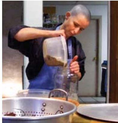
Meal prep at Zen Mountain Monastery

BHIKKHU BODHI: In Sri Lanka, where I lived as a monk, it hasn't been customary to give temporary ordination. In this respect, Sri Lanka is different from other Theravada countries like Thailand and Burma, where temporary ordination is an integral part of the Buddhist culture. I don't have direct experience with it, but it seems that it could be an effective way to help people who are not intending to live as monastics their whole life to acquire some experience of what it means to actually live as a monk, to get firsthand experience of living as a member of the sangha. They'll come to